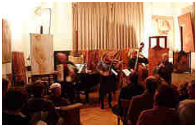
Concert by Krupnik